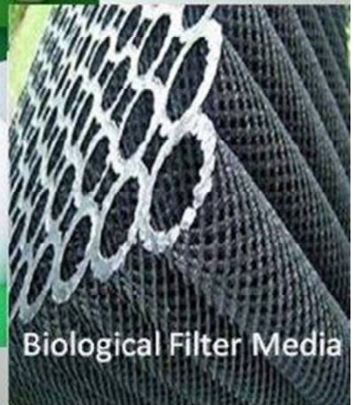
Biological Filter Media