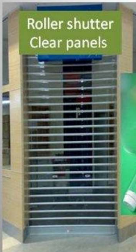
Roller shutter Clear panels