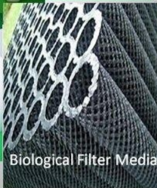
Biological Filter Media