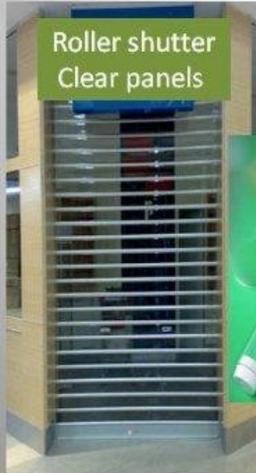
Roller shutter Clear panels